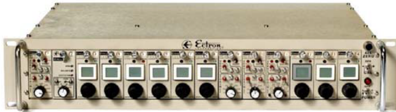
Model R408-14 Fourteen-channel Rack-mount Enclosure