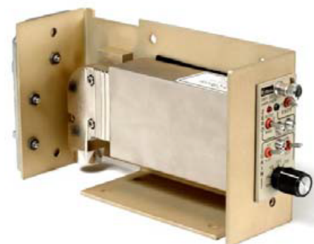
Model E408-1D Single-unit Mount, including DIN-rail adapter