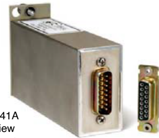
Model 441A Rear View with Connector

For price and delivery information, please contact the factory or the Ectron representative in your area.