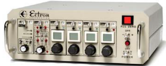
Model E408-6 Six-channel Portable Enclosure

The Models 441A and 441AL will operate in all standard Ectron enclosures designed for Models 352 and 428 Conditioner-Amplifiers and Model 451 LVDT Signal Conditioners. These include Models E408-1, E408-6, and R408-14 enclosures.